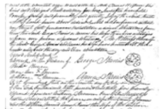
An example of a very old deed from www.annapolisheritagesociety.com/genealogy