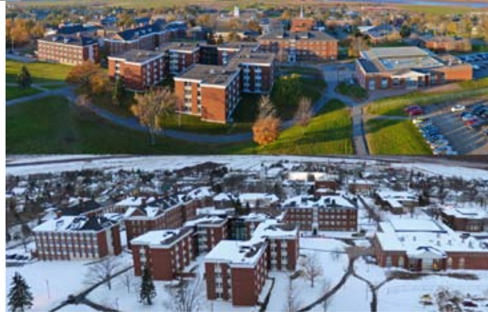
Acadia, taken by Loay Jabre from the North side of the Acadia Tower, 13th Floor