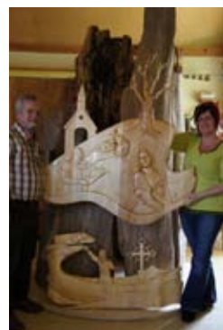
The Acadian Section

This exceptional project has taken on an unexpected human dimension in the form of heart warming encounters, creating strong bonds of friendship between the artists and their communities.