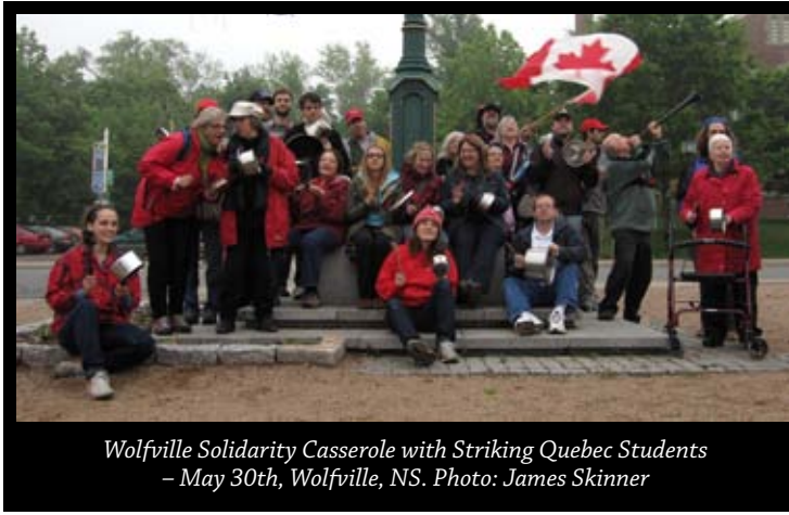
Wolfville Solidarity Casserole with Striking Quebec Students - May 30th, Wolfville, NS.

1. Donald Sutherland; 2. six; 3. third (17th); 4. Change of Name Act; 5. Mahone Bay