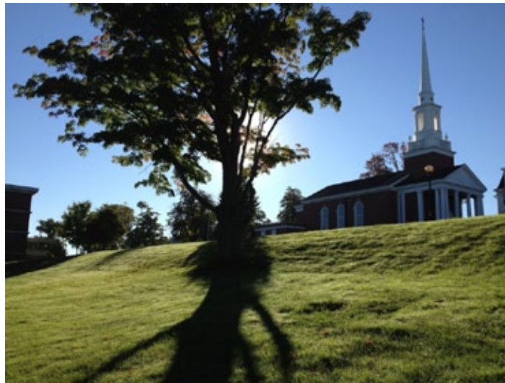
no birds no breeze wet grass dead leaves - Claire Colville (photo and poem)

1. Nova Scotians; 2. Tuxedo Stan (a cat); 3. Bluenose II; 4. Robert L. Stan; 5. 'not intoxicated' (field of Truro; S. not intoxicated)