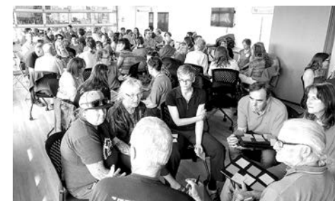
GND TH meeting organized in Whitehorse a few weeks ago.

Closer to home, a coalition of workers, artists, Indigenous leaders, scientists, youth, and people directly impacted by climate catastrophe have banded together as part of a movement for a Green New Deal for Canada. Their approach has been to create a policy platform aimed at re-tooling the Canadian economy to respond to a number of crises we are facing: climate change, but also rising inequality, systemic discrimination, and an economy that doesn't meet the needs of people or the planet.