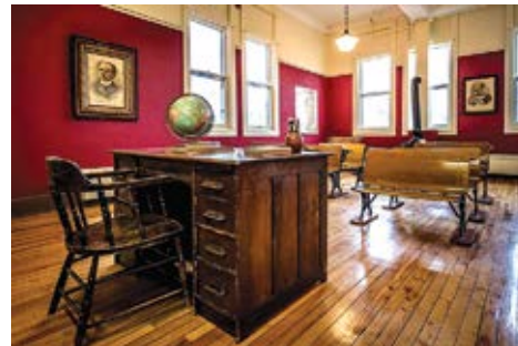
Macdonald Museum School Room.

Located in Middleton, the Macdonald Museum houses numerous exhibits including the Nova Scotia clock collection, as well as a research library for genealogical historical research. Between May and December, the museum also hosts a community farm market on Thursdays, 4pm-7pm (call 902-825-6116 for more information).